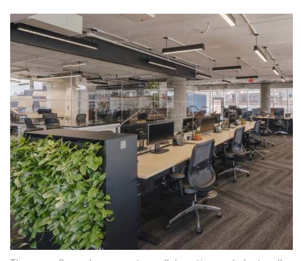
The open-floor plan promotes collaboration and plant walls help beautify as well as clean the air.

Delos decided to prove the environmental and health benefits of their space by seeking and achieving LEED Platinum, WELL Platinum and Living Building Challenge Materials Petal certifications. And Superior Essex sustainable cabling solutions helped contribute to all three of these green building standards bring Delos's plans to fruition.